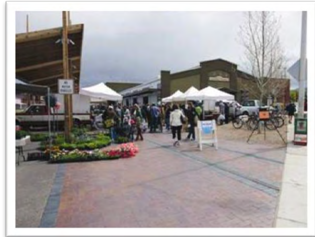
Santa Fe Farmer's Market, Santa Fe, New Mexico