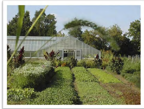
Urban Oaks Farm, New Britain, Connecticut