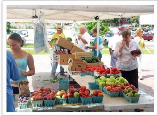
Brownfields to Farmers Market Shelton, Connecticut