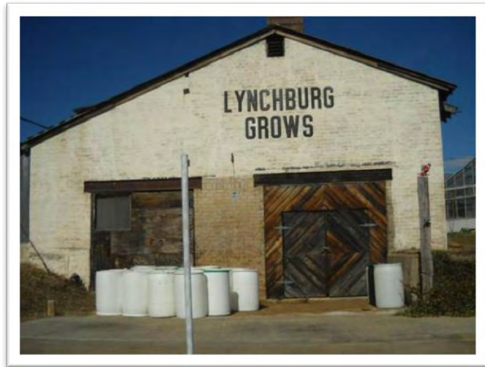
Barn, Lynchburg Grows! Lynchburg, Virginia